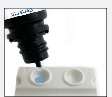
STEP 2: Place 1–2 drops of SilverSense SDF into a disposable dappen dish. Tinted blue for increased visibility.